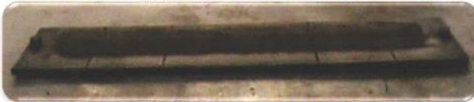
FIG. 2 Post Test