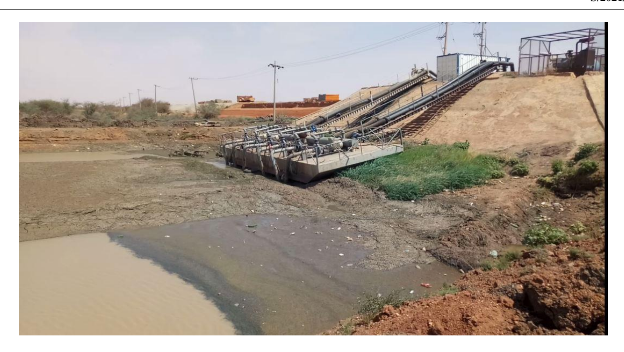
Figure (2): River receding images in front of El Salha Water Plant, captured on July 20, 2020

It is to be reaffirmed that, the unilateral filling of the GERD is against the international law, and against the principles set in the DOP, which may seriously affect the people of Sudan. It is also against the request of the AU led process "Parties to refrain from unilateral actions".