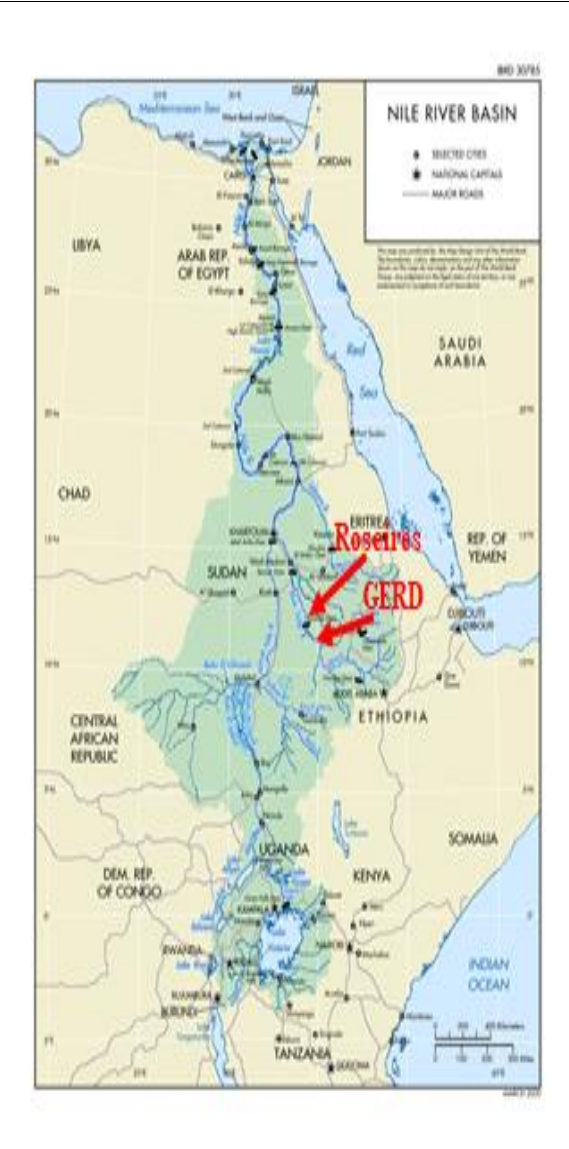
Fig. 1: Map of the Nile Basin