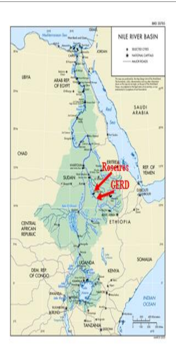
Fig. 1: Map of the Nile Basin