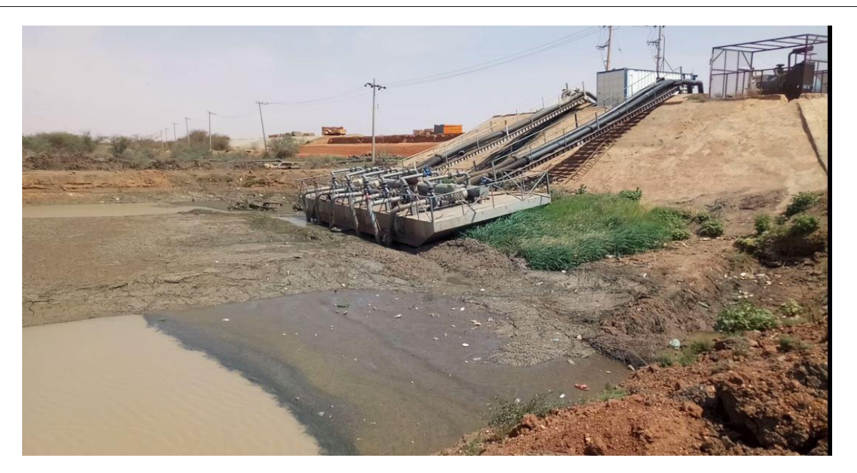
Figure (2): River receding images in front of El Salha Water Plant, captured on July 20, 2020

It is to be reaffirmed that, the unilateral filling of the GERD is against the international law, and against the principles set in the DOP, which may seriously affect the people of Sudan. It is also against the request of the AU led process "Parties to refrain from unilateral actions" .