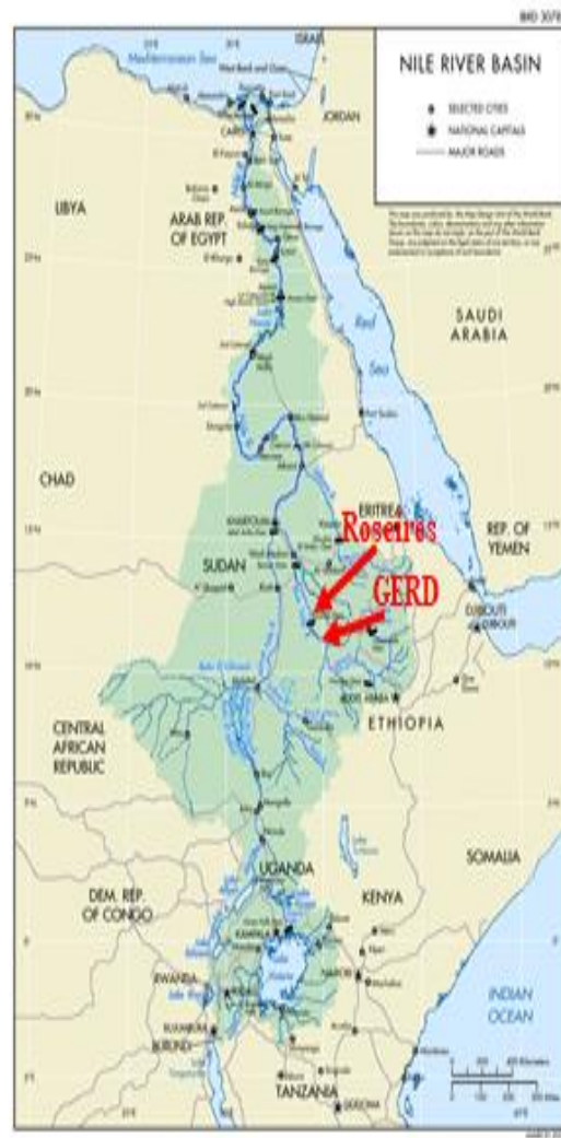
Fig. 1: Map of the Nile Basin