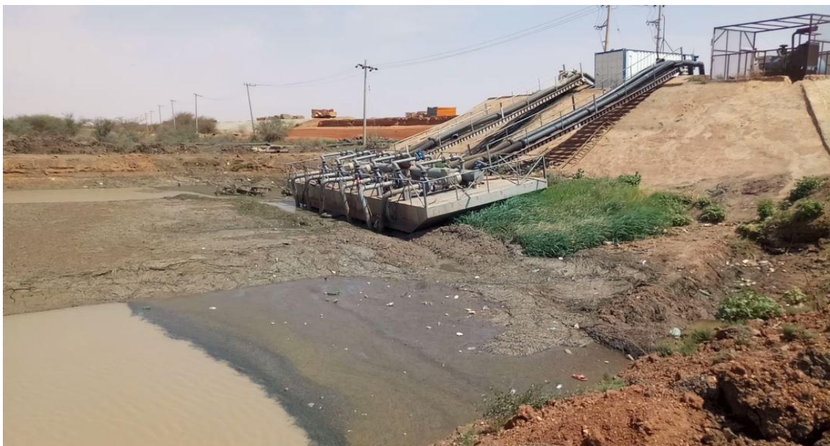
Figure (2): River receding images in front of El Salha Water Plant, captured on July 20, 2020

It is to be reaffirmed that, the unilateral filling of the GERD is against the international law, and against the principles set in the DOP, which may seriously affect the people of Sudan. It is also against the request of the AU led process “ Parties to refrain from unilateral actions ”.