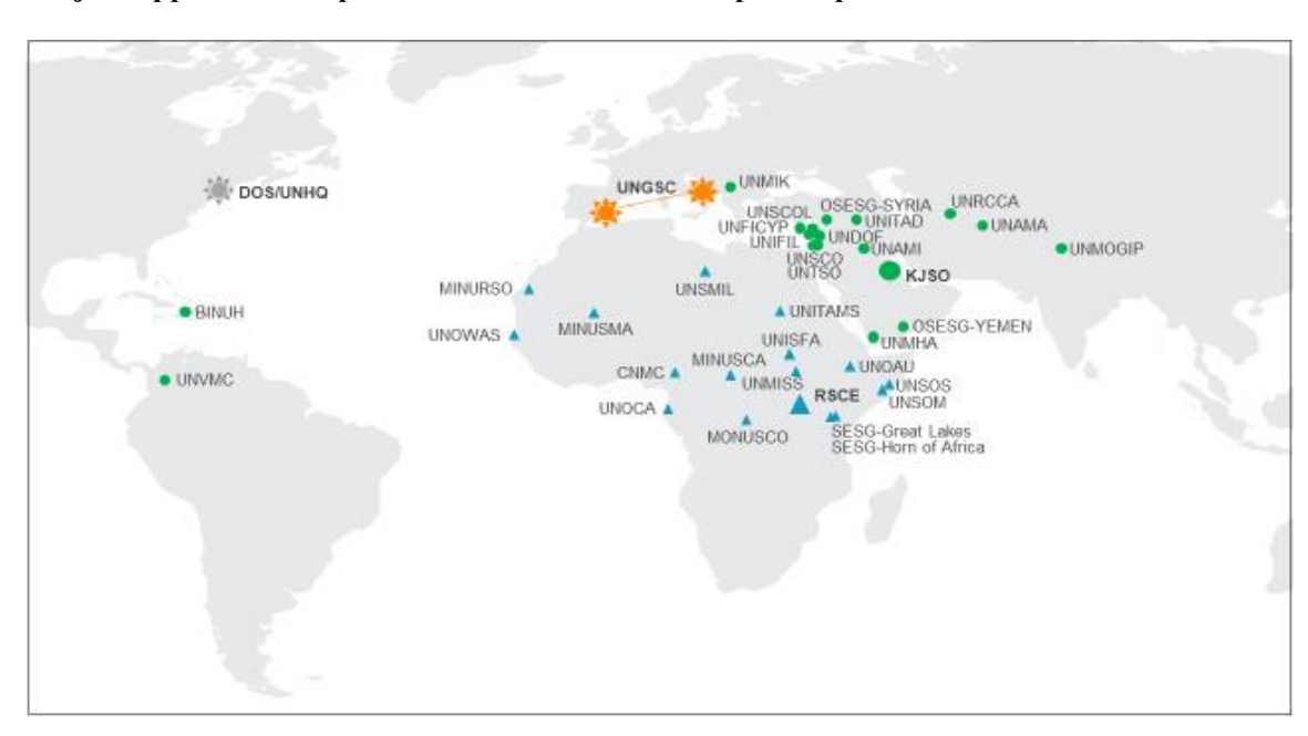
Map 2 Major support service providers for United Nations peace operations

Abbreviations: BINUH, United Nations Integrated Office in Haiti; CNMC, Cameroon-Nigeria Mixed Commission; DOS, Department of Operational Support; KJSO, Kuwait Joint Support Office; MINURSO, United Nations Mission for the Referendum in Western Sahara; MINUSCA, United Nations Multidimensional Integrated Stabilization Mission in the Central African Republic; MINUSMA, United Nations Multidimensional Integrated Stabilization Mission in Mali; MONUSCO, United Nations Organization Stabilization Mission in the Democratic Republic of the Congo; OSESG, Office of the Special Envoy of the Secretary-General; RSCE, Regional Service Centre in Entebbe, Uganda; SESG, Special Envoy of the Secretary-General; UNAMA, United Nations Assistance Mission in Afghanistan; UNAMI, United Nations