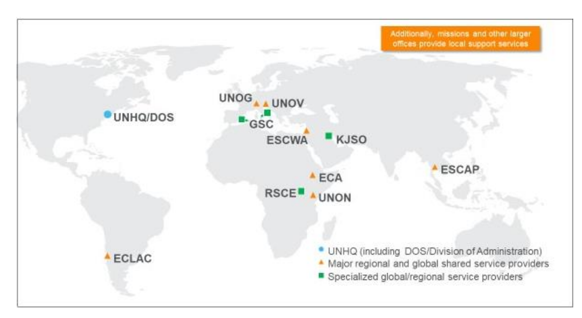
Map 1 Major support service providers across the United Nations Secretariat