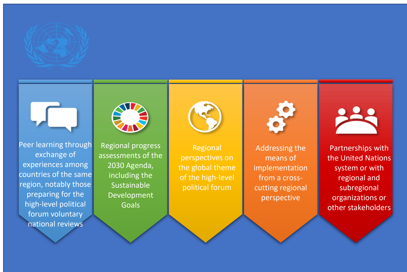
Figure I Regional forums on sustainable development

4. Other significant examples of regional intergovernmental platforms harnessed to support the implementation of the 2030 Agenda are listed below.