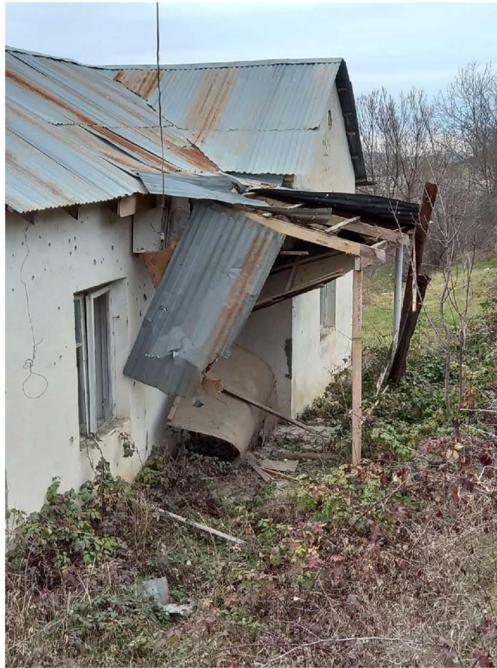
Image 2 . Damaged community building in Parukh village

March 11, 2022 - 7 projectiles exploded in the direction of Parukh village of Askeran region between 12:00-19:00.