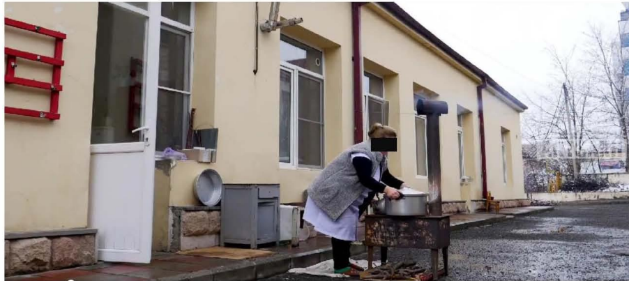
Image 6. The process of food preparation in one of the kindergartens of Stepanakert

process of organizing and delivering children's food in kindergartens. The staff has to use wood and electric stoves installed outside for cooking 6 .