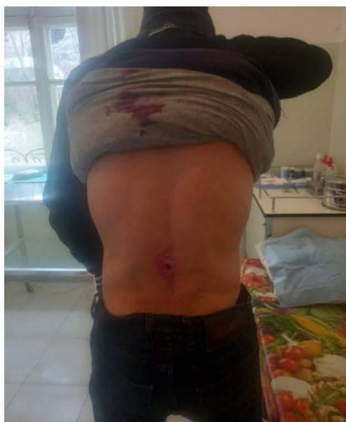
Image 5 . Injured civilian in Khrmort