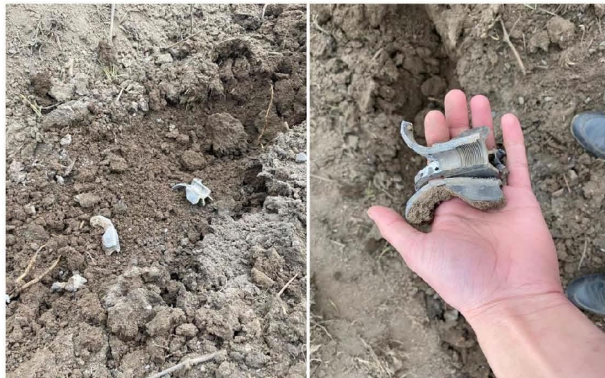
Image 4 . Ammunition remains in a vineyard in Khrmort community