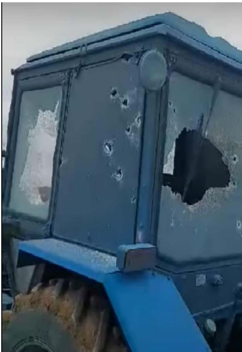
Image 3 . Damaged tractor in Nakhichejanik village