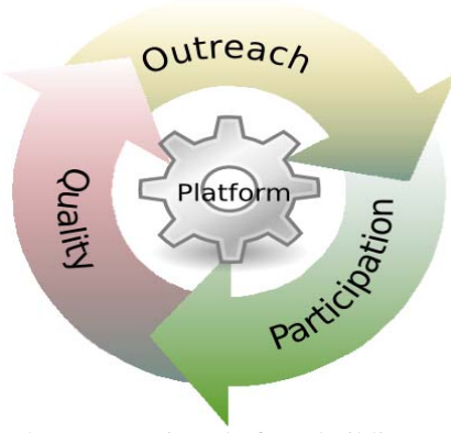
The UNEP-Live platform building on success to improve environmental assessment

5. This diagram represents how development of the UNEP-Live platform will respond to these requirements. The platform is to foster greater Member State participation in environmental assessment processes at all levels through improved access to and reuse of data, information, knowledge and expertise. This in turn is expected to improve the quality of assessment products in terms of their timeliness, comprehensiveness, accuracy, richness and so on. Making it easier to tailor the packaging of each assessment's messages for different audiences ought to increase the outreach of