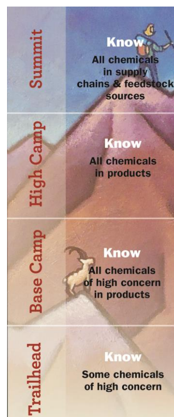
Figure 2. Stages in Knowing Chemicals in Products and Supply Chains (Source: Rossi, Peele, & Thorpe, 2012)

Driving these escalating demands for chemical information is "retailers' need to compete for customers who want sustainable products and to support their sustainability claims, as well as standards adopted in Europe that affect large retailers in today's global economy" (Rizzuto, 2014). Due to their huge market share, retailer demands for disclosure are having a major impact on brands. When retailers like Walmart request chemical ingredient disclosure, brands are likely to follow since much of their sales are in the largest retailers. Clorox Co., for example, sells 26 percent of its products to Walmart stores and its affiliates (Rizzuto, 2014).