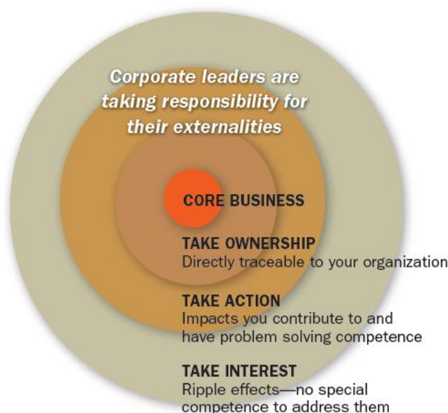
Figure 1. Leadership in the Age of Transparency: Ripples of Responsibility

While the market barriers to knowing chemicals in products and supply chains are clear, companies that overcome these barriers capture clear benefits by reducing costs, protecting and more importantly enhancing brand reputation, managing supply chain quality, improving transparency and communication throughout the supply chain, expanding market share, and increasing trust among consumers, employees, and communities. Protecting brand image, in particular, is a significant driver for sustainability initiatives in general. As the 2009 European Sustainable Procurement Benchmark (a survey of procurement executives at 95 of Europe’s