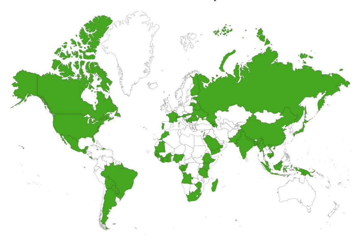
Figure II Countries and areas that celebrated the International Day of Forests in 2014

62. Sixty-eight countries reported having hosted activities to celebrate the International Day of Forests in 2014 (see figure II). Low-forest-cover countries like Armenia, the Comoros, Kenya, Mauritania, Nigeria, Pakistan, Saudi Arabia, South Africa and Yemen also celebrated the International Day. In addition to submitting national reports, the following prepared special reports on activities carried out in celebration of the International Day in 2014: Argentina, Brazil, China, Indonesia, Jamaica, Kenya, Madagascar, Portugal and the State of Palestine.