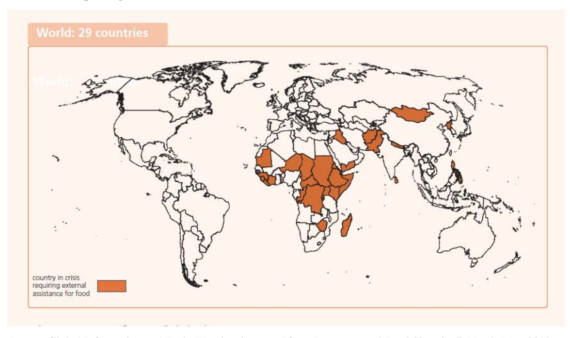
Figure II Countries requiring external assistance for food