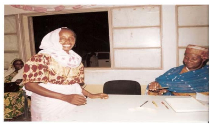
The Minister holding the knife presented to her