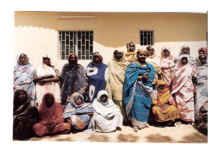
Group photo of the Minister with the circumcisers