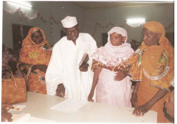
Partnership agreement between the circumcisers and the authorities